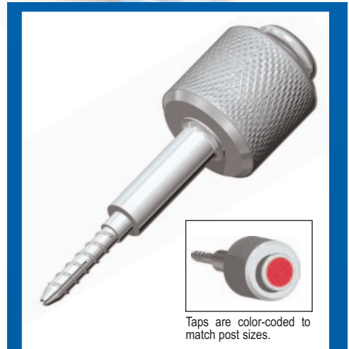
Taps are color-coded to match post sizes.

Predictable method of post placement for every clinical situation (Flexi-Flange Fiber is recommended when choosing a fiber post in clinical cases with little or no coronal dentin).